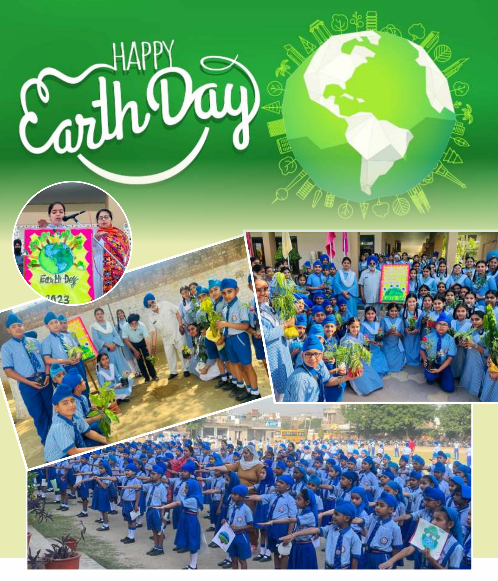
World Earth Day Celebrated with great zeal by the students & staff. Planting saplings at home and school campus; best out of waste; card making; awareness about organic vegetable gardens at home; quiz, speech and poem recitation garnished the morning assembly.